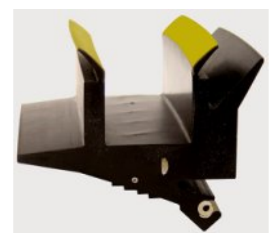
Figure 3 PTFE Neck Seal