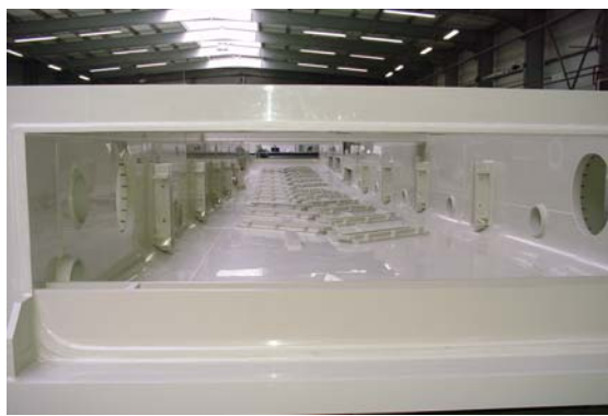
Figure 3: Pickling tank