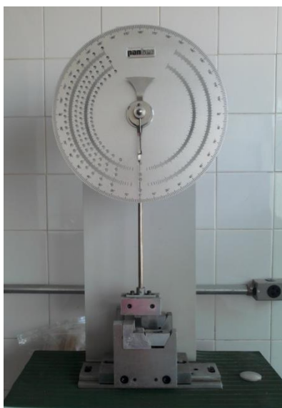
Figure 2. Izod equipment and standard specimen schematic

Plates of each composite were then cut, into bars measuring 125 x 12,7 x 5 mm which were the basis for making specimens of Charpy impact test in accordance with ASTM D256. The specimens were tested in a pendulum Pantec, Figure 2, in Izod configuration.