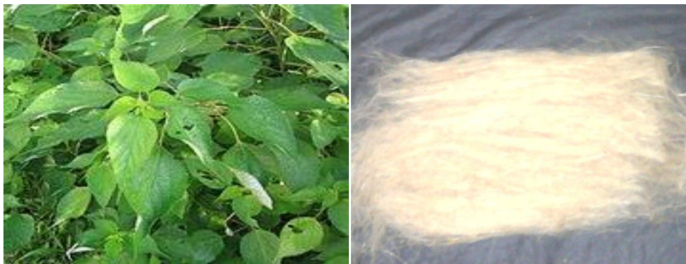
Figure 1. The ramie fiber (a) and a bundle of ramie fibers (b).