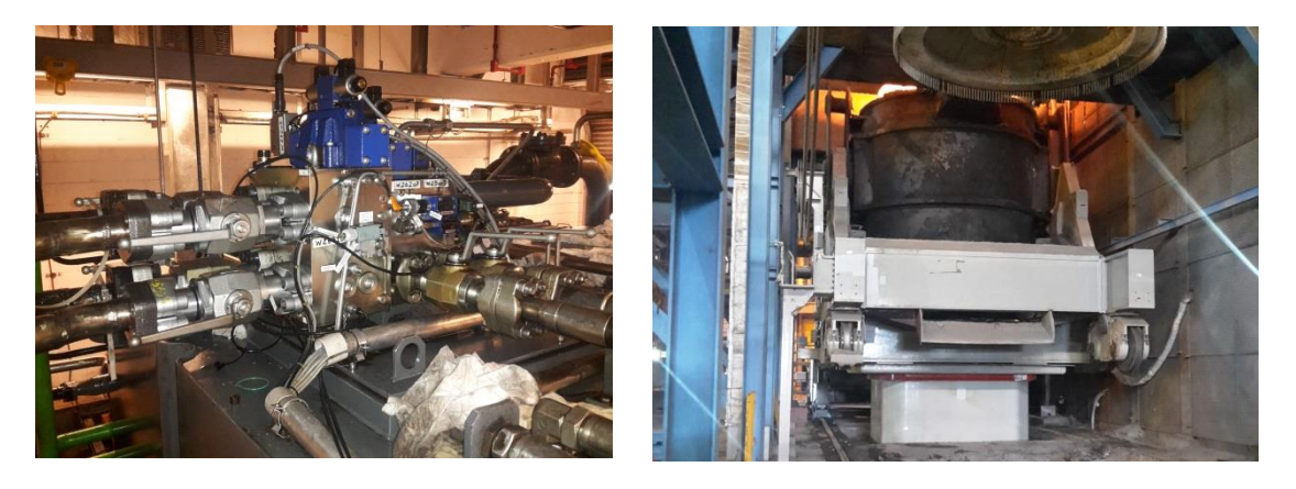
Figure 2 Hydraulic block distributors and ladle lifting table

ladle without the need of external power, accumulators or any dedicated system. In case of ladle break-out the steel flow is directed to an emergency pit located outside the lifting table area. This system gives the advantage of an open view around the ladle and vessel system with easy access to all plant parts.