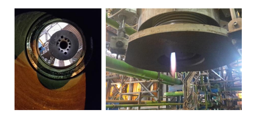
Figure 4 COB Lance including top view and ignition burner flame.

The lance is a fundamental part for the RH plant and requires reliable design in all its components like lifting and lowering mechanic, water cooling, vacuum sealing, and maintenance access in case of malfunctions. Full automatic functions are programmed in order to allow an easy start of the burner and/or a set points adjustment during the treatment.