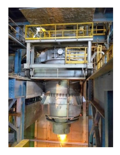
Figure 3 RH vessel including vessel transfer car

The plant layout allows a fast vessel exchange solution, complete exchange is performed in sixty minutes. Plant maintenance, access to different plant parts, plant observation during treatment are also an advantage of this solution. Alloy connection to the vessel, all media supplies to the vessel, hot off take connection are of easy access. See Figure 3 RH vessel including vessel transfer car.