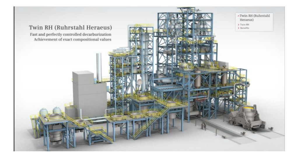
Figure 1 3D Model of the RH plant

The new plant configuration gives the possibility to increase the high quality grade production, especially deep drawing grades. CSA established high quality standard for their final products. See Figure 1 3D Model of the RH plant