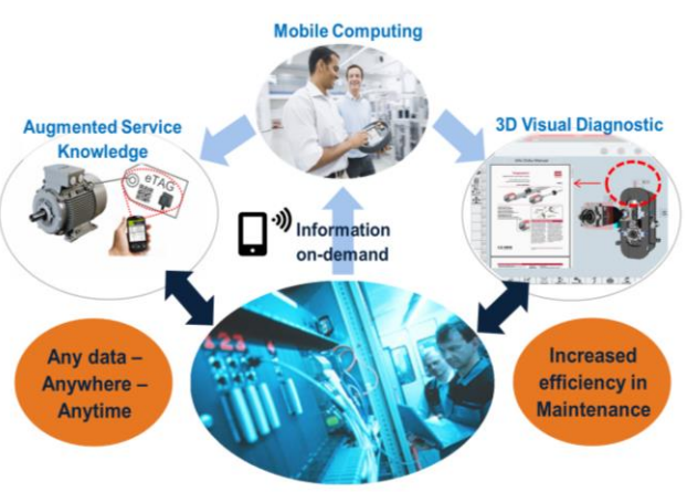
Figure 8 Smart Work concept