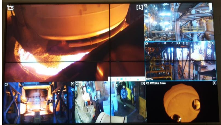
Figure 7 Plant operation overview

The level 2 models are supporting all process phases indicating the correct recipe for oxygen and aluminium additions when it is time to achieve the decarburization and the thermal balance of the treatment. The alloying model corrects the steel analysis in all different process phases. The process phases are so constructed that the operators have a consequent logic overview over the different priorities. A high accurate thermal model gives an exact temperature prediction. Offgas analyses data and process flow control give an indication of the decarburization efficiency. When the process models results are displayed then the operator has to acknowledge them in order to transfer the set parameters to the plc and to start oxygen blowing sequences, material discharging, vacuum regulation etc.