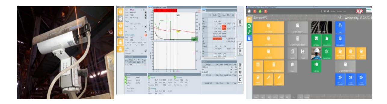
Figure 6 Camera system – Level 2 main process overview

The control room has no direct view over the plant operations considering that after a certain time the windows view are reduced almost to zero because of glass damages or excess dirty glowing on the glass, mostly small sparks and steel splashes.