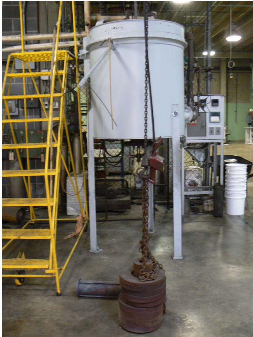
Figure 3 – Hot Load test showing weights for load

The Hot Load (clustering and reducibility) test (Figures 2 and 3) is run at 816 °C, which was appropriate for DR operations for many years. Likewise, the ISO test for clustering (ISO 11256) is run at 850 °C, and the reducibility test (ISO 11258) is performed at 800 °C, all in the same general range.