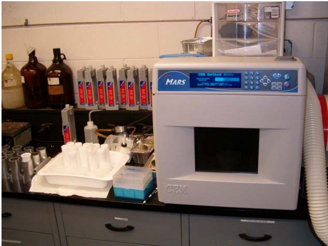
Figure 5 – Microwave digestion for the ICP

In June 2008, we added a combination X-ray fluorescence/ X-ray diffraction (XRF/XRD). This will provide independent confirmation of the elemental analyses performed by the ICP. More importantly, it will provide the opportunity to define the nature of the compounds present in the ores, and allow detailed characterization of the mineralogy. Test programs are envisioned in several areas: