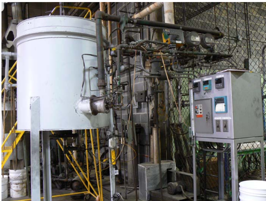
Figure 2 – Hot Load test for clustering and reducibility