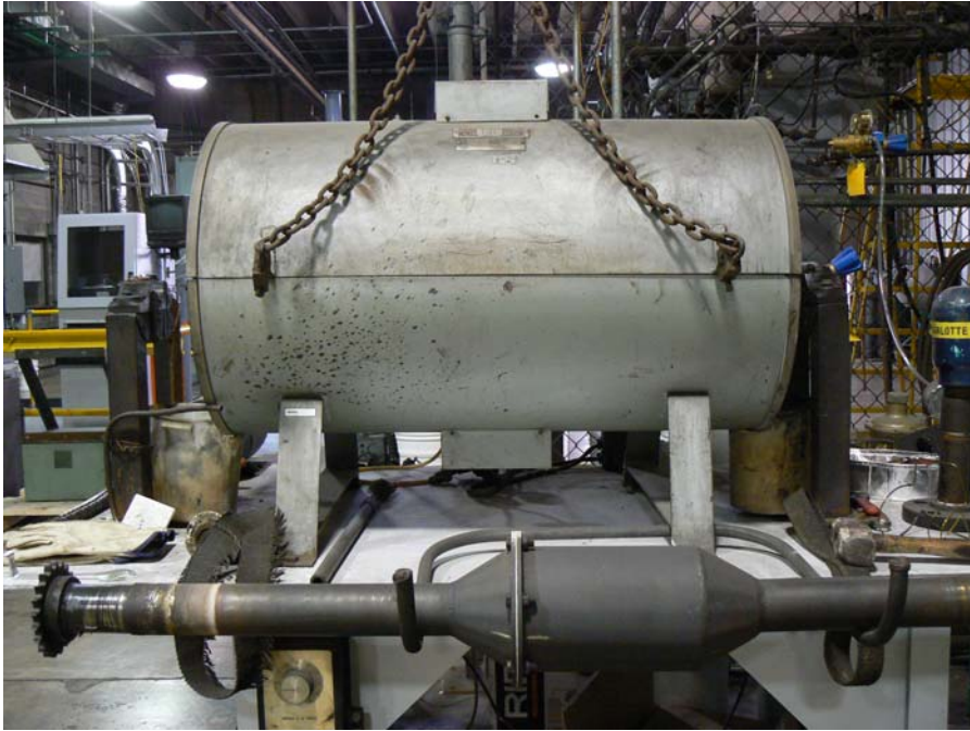
Figure 1 – Linder test for low temperature disintegration

There are three main areas of concern in testing of DR ores: low temperature disintegration, reducibility, and clustering. Midrex Technologies Inc. (MTI) has historically used two tests (Hot Load and Linder) to evaluate these parameters. These tests have been in use at MTI and by its clients for over 35 years. An extensive historical database has been developed. The Linder test (Figure 1) is designed primarily for low temperature behavior, and is essentially similar to ISO 11257.