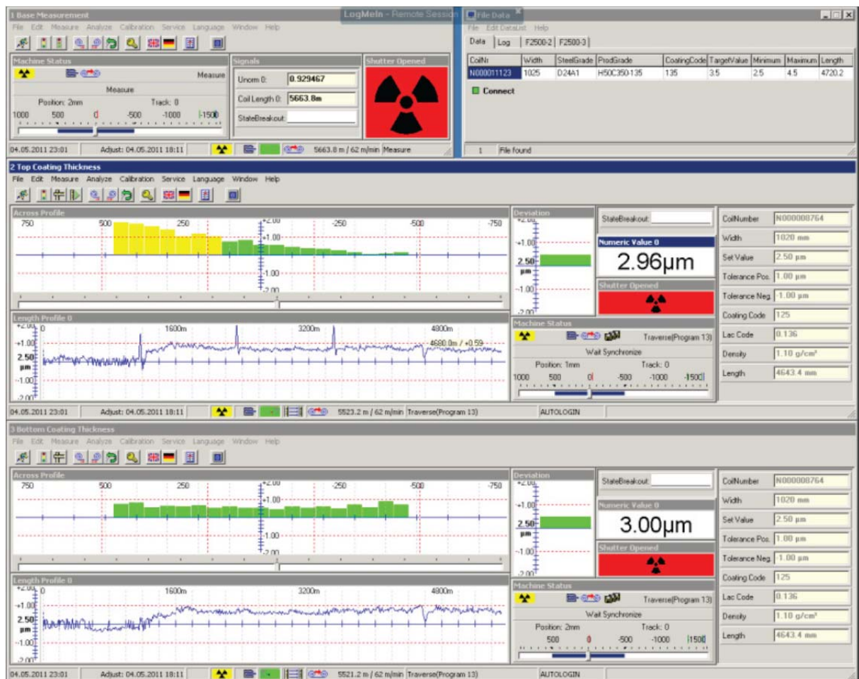
Figure 4. F2800EL configuration.

The flexibility of the Mesacon F-Series software allows the full adaption of HMI for operation, maintenance and offline reporting. Visualization and interfaces can be adapted to any line and the different design and capabilities of the coater itself.