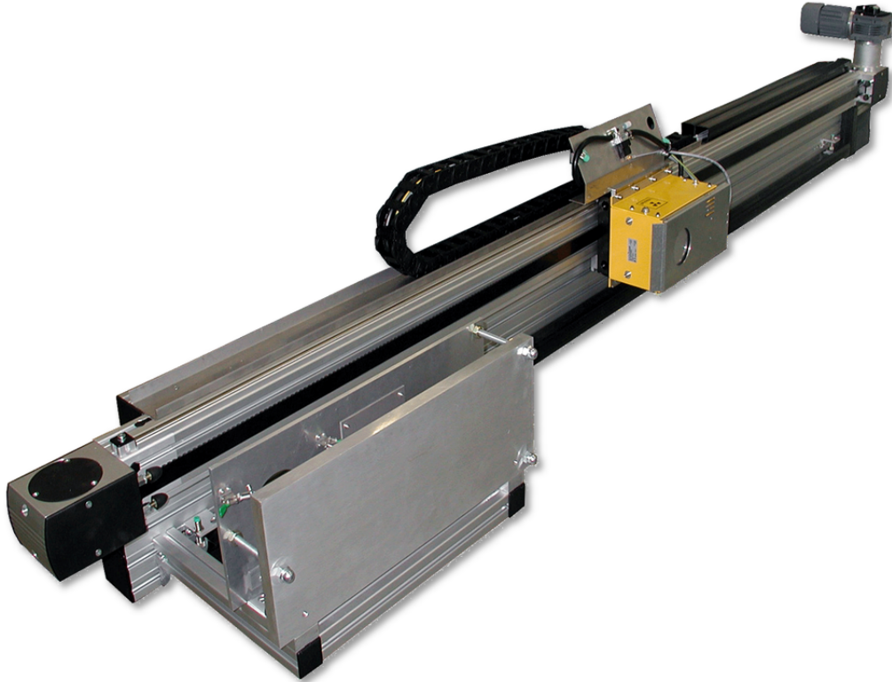
Figure 2. F2800EL mechanics configuration.

A linear moving unit designed for 24/7 operation is used for the scanning movement of the sensor. Mounting bracket with samples for zero adjustment and calibration is included. System operates in full automatic mode without any action of the operator.