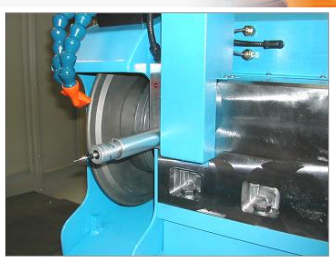
Figure 4: APCD - Automatic profile control device.

Laminação Rolling 49° Seminário de Laminação - Processos e Produtos Laminados e Revestidos 49° Rolling Seminar - Processes, Rolled and Coated Products