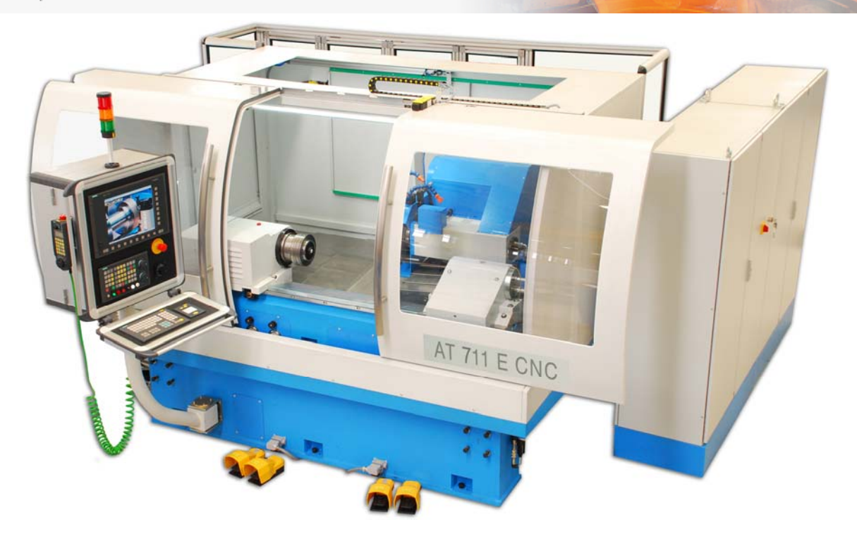
Figure 1: Machine AT711 E CNC.

All the concepts that made those models famous and appreciated are still present in the new AT711E CNC. In particular: