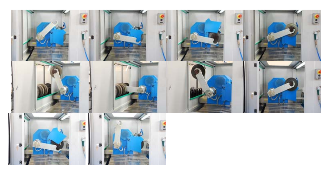
Figure 3: Wheel changing sequence.

Once that sequence is completed, the machine is ready to resume another automatic grinding cycle.