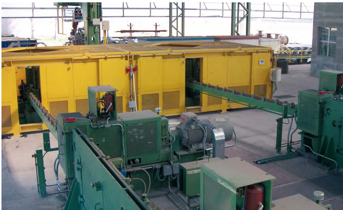
Figure 1. Entry section of compact coiling system.