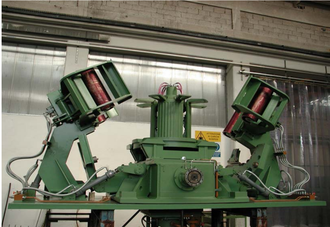
Figure 2. Vertical coiler arrangement.