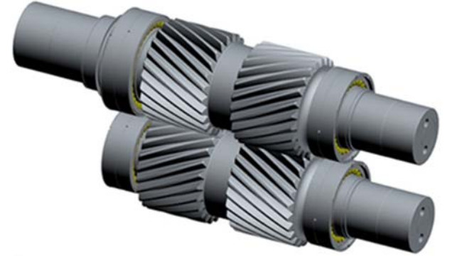
Figure 1. Mill pinions

Preliminary calculation and design according ISO, DIN or AGMA standard, with safety factors based on more than 125 years of experience in metallurgical plant and rolling mill technology.