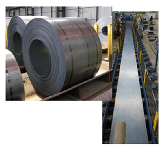
Figure 6. Hot rolled carbon steel strip (2.5mm) after laminar cooling on the exit roller table of the rolling mill (right); Hot strip coils build up by plasma welding of several strip pieces (left).

Meanwhile belt cast carbon steel has been success-fully hot rolled down to a thickness of 2.5 to 5mm, coiled and tested in downstream process steps [4]. The technical properties allow for first commercial applications (Figure 6).