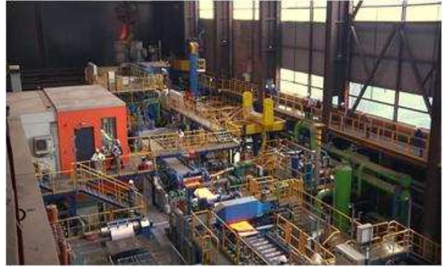
Figure 5. Belt casting plant in production process.

Meanwhile belt cast carbon steel has been success-fully hot rolled down to a thickness of 2.5 to 5mm, coiled and tested in downstream process steps [4]. The technical properties allow for first commercial applications (Figure 6).