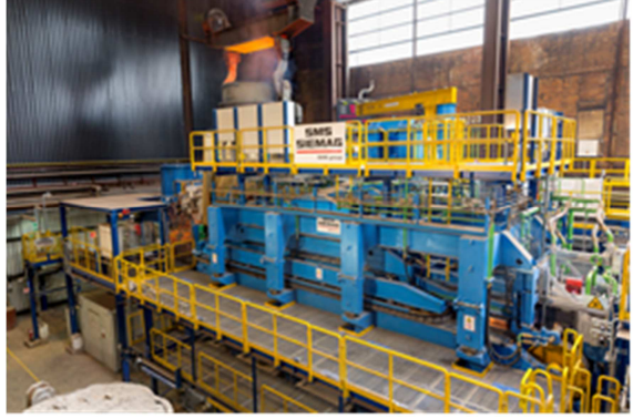
Figure 2. Set-up of BCT® caster in Peine.

In December 2012, the cooperation partners Salzgitter Flachstahl and SMS Siemag did jointly commission the facilities in order to implement the benefits of this technology on an industrial scale.