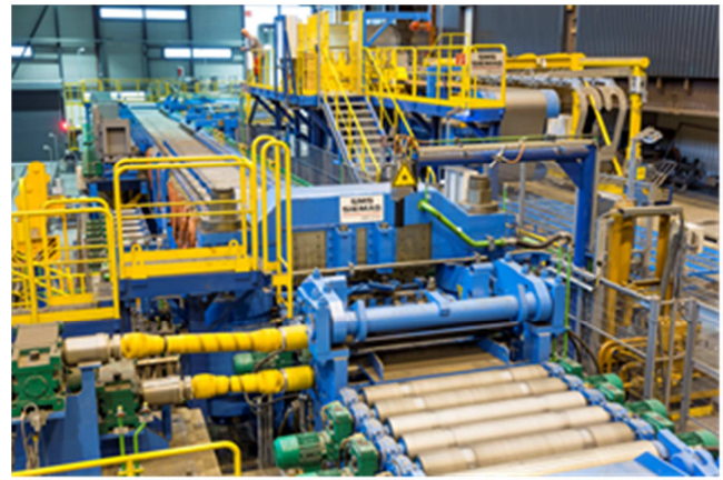
Figure 4. Shear and roller table.

A roller table accelerates the sheets which here have a maximum length of 9 m; towards the end of the roller table the sheets are decelerated again. Cross-pushers place the sheets on a hydraulically operated lifting table. The sheets stacked on pallets are loaded onto wagons and taken to the rolling mill in Salzgitter..