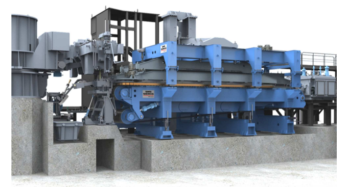
Figure 1. BCT® caster

The newly developed plant concept based on Belt Casting Technology (BCT®) is now realized by SMS Siemag for the first time on an industrial scale.