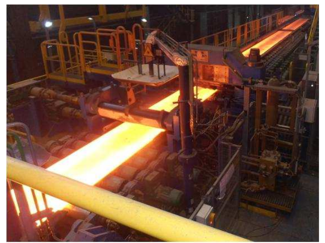
Figure 7. As-cast strip (FeMn-grade) passing the shear.

Beside carbon steel, complete FeMn melts could also be casted safely several times. Then the regular casting time amounts to roughly 40 minutes. Figure 7 shows the as cast strip of a FeMn steel grade. A total product length of about 600 m is passing the shear to be cut into 9m-long plates.