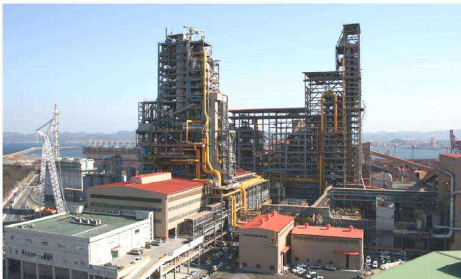
Figure 2: FINEX ® 1.5 MTPY Plant at the Pohang Works

The start-up of the 1.5-mtpy FINEX ® at Pohang works has been successfully performed. As shown in figure 3, the productivity has been increased and reached the target value of daily 4,300 ton in May of 2008. With the operation optimization and facility stabilization, the coal consumption rate is decreased down to 700 kg/t HM and high plant availability is achieved at present.