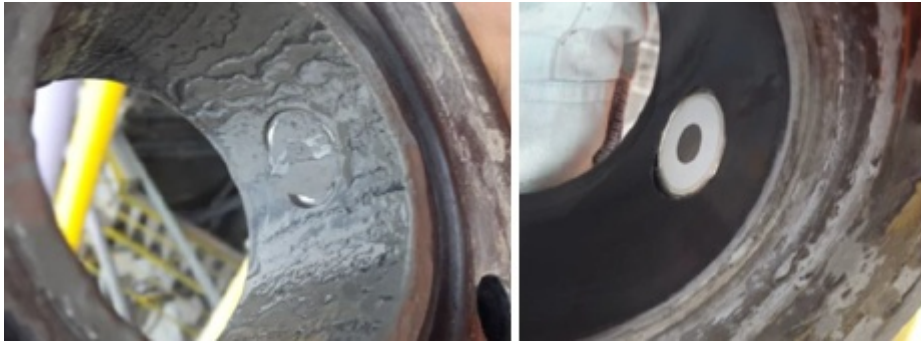
Figure 3. Correct flush mounted installation of the SDM sensor in the UHPE wafer cell.

the excellent installation and calibration of the Slurry Density Meter accuracy of at least +/- 5 g/l was achieved.