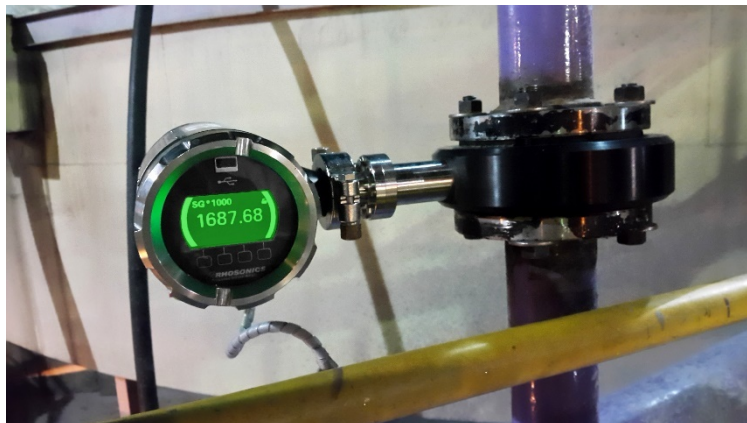
Figure 2. The Rhosonics model SDM Slurry Density Meter at Minera Poderosa in Peru.

Compañía Minera Poderosa S.A. needed to measure and control the slurry density in the discharge pipe line of a tailings thickener in order to improve the filtering stage of their Mineral Processing Plant in Peru. The ultrasonic density meter of Rhosonics was installed by means of an UHPE ultrasonic wafer cell which is mounted between flanges.