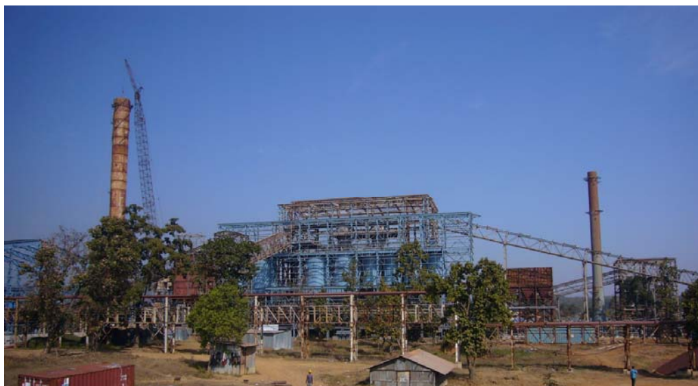
Figure 3. First CPT plant under construction in early 2015