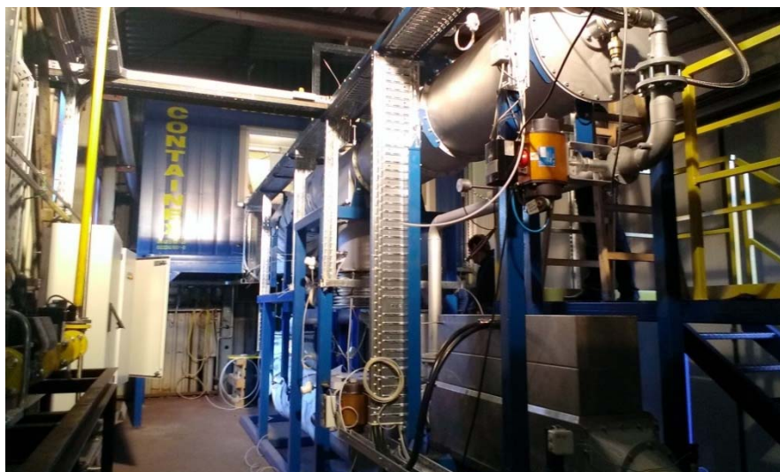
Figure 4. Pot grate test facility

range of metallurgical test work and analyzing apparatuses, Primetals is able to offer a full test work from Run of Mine material to liquid steel and by that is the ideal partner for any Client for developing the optimum processing route for any type of iron ore. The following Figure 4 shows the pot grate test facility.